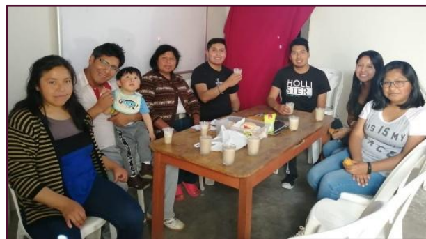
TMC Training in Tacna, Peru

In January 2020, the South American training was held in Tacna, Peru for four new members of the TMC. These young adult Friends are letting their lights shine! The North American training, which was held in Massachusetts at the beginning of March, included two new ministers, both seasoned Friends. The Central American training, which was to be in El Salvador but was delayed first due to visa difficulties and later due to the pandemic, happened virtually later in the year.